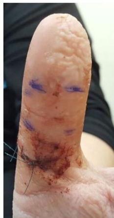
Figure 1. Injured digit distal to the laceration showing no wrinkling while the healthy side is wrinkled.